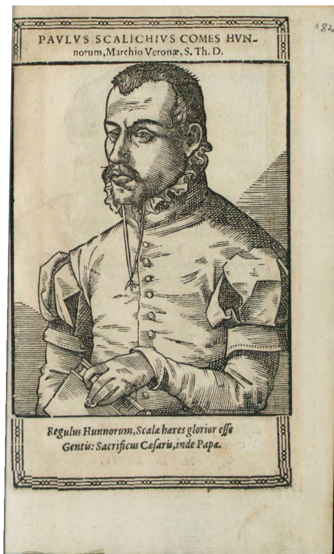
Fig. 1. Portrait of Paulus Scalichius. From Nikolaus Reusner, Icones sive imagines virorum literis illustrium (Argentorati: Bernardus Iobinus, 1587), f. 182r.